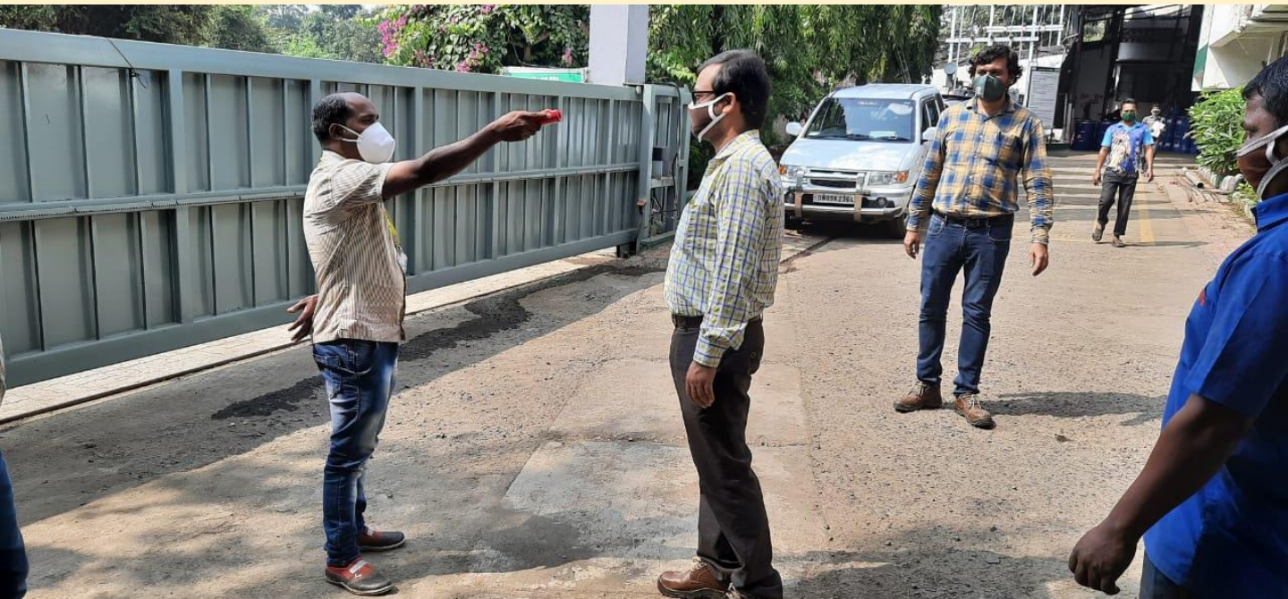
On 4 th November 2020, a surprise medical examination of COVID-19 related documents and health of employees at Industrial Packaging, Silvassa was done by Vinoba Bhawe Government Hospital, Silvassa.