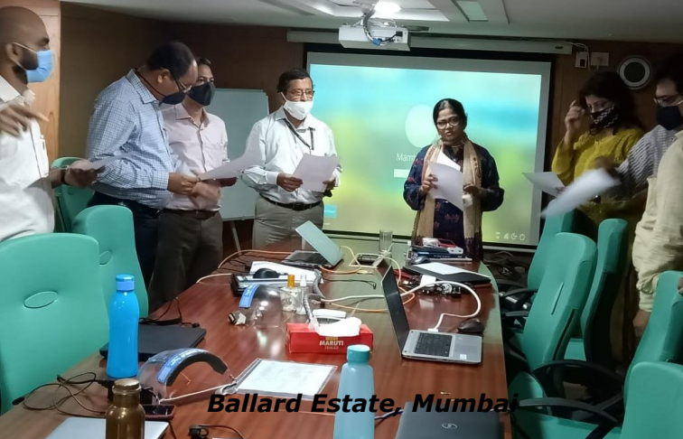
Ballard Estate, Mumbai