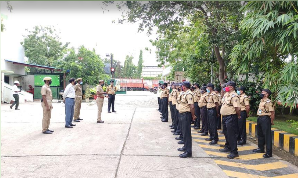
A fire fighting training was organised at Manali, Chennai industrial complex. The training was conducted by Local Inspector of fire service and his team.