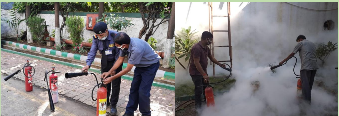
A fire mock drill and training was organised at Industrial Packaging, Silvassa.