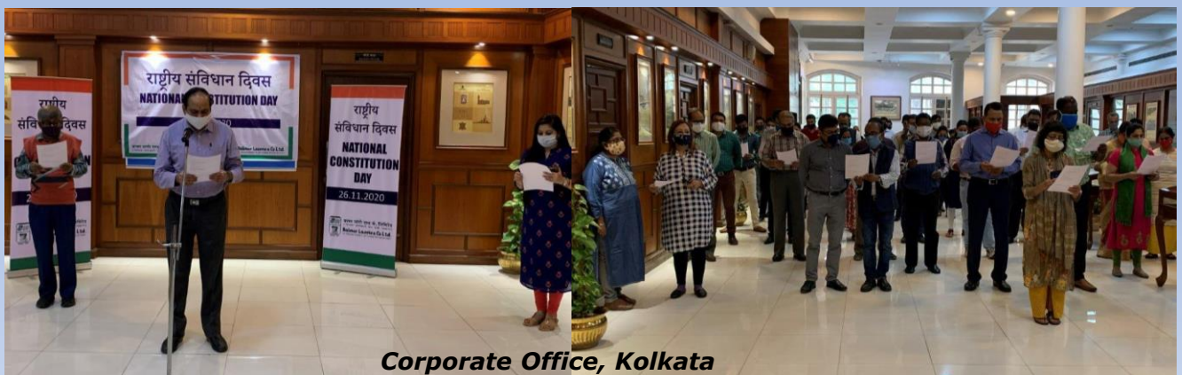
Corporate Office, Kolkata

Below are glimpses of reading out of the preamble at different locations: