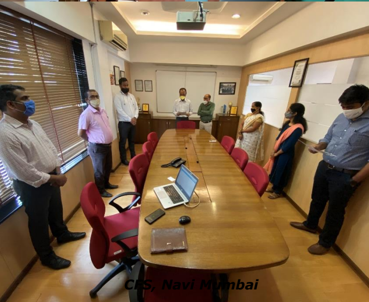
CFS, Navi Mumbai