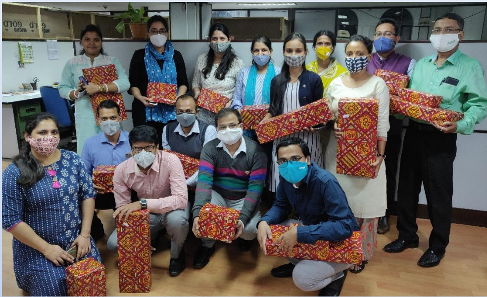
Winners of online quiz, essay & slogan competitions at the Corporate Office in Kolkata

26 th November 2020 was observed as Constitution Day across the country to commemorate the adoption of the Constitution of India and to honour the contribution of the founding fathers of the Constitution. On this day the preamble is read out in all Government Offices, institutions and other establishments. At Balmer Lawrie too the preamble was read out in plants and offices across locations pan India. On 26 th November 1949, the Constituent Assembly of India adopted the Constitution of India, and it came into effect on 26 th January 1950. The Government of India declared 26 th November as Constitution Day on 19 th November 2015 by a gazette notification. Various programs were also organised across locations. In the Eastern Region an online quiz, essay & slogan competitions were organised. At Industrial Packaging, Silvassa, an awareness video was shown and a Q&A session on fundamental duties was organised.