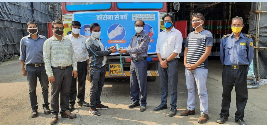
Sanitizers and masks were distributed as part of the COVID-19 Janandolan campaign at Industrial Packaging, Silvassa.