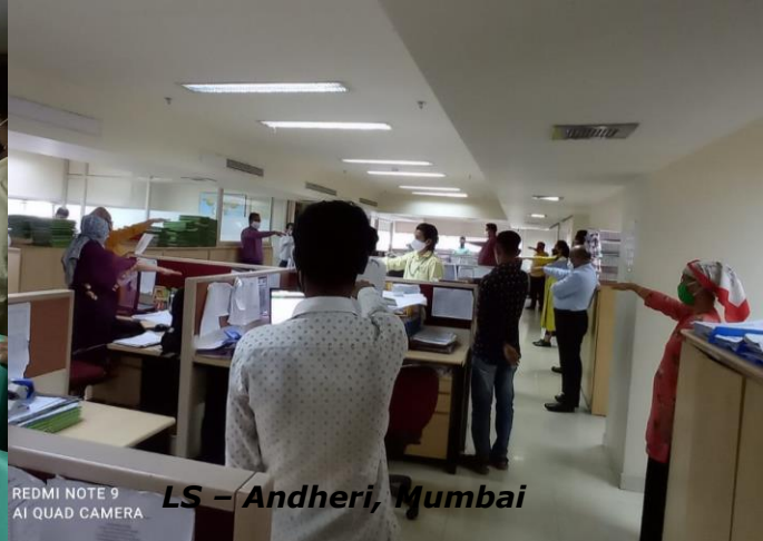
LS - Andheri, Mumbai