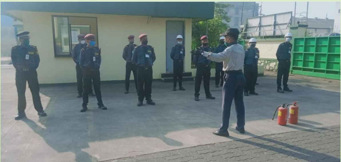
Training on fire fighting was conducted at Industrial Packaging, Navi Mumbai.