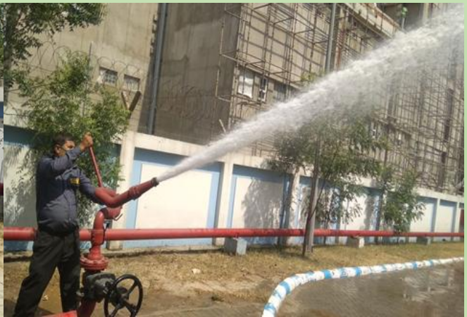
A preventive measure has been adopted at TCW, Rai to cool down the ambient temperature inside the plant