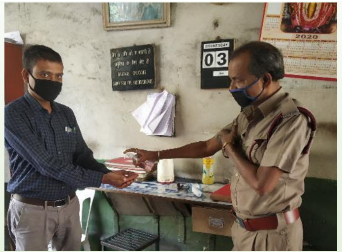
Hand sanitization is being done at all plants / offices