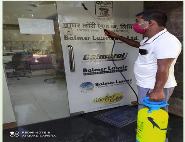
Sanitization at IP, Taloja and IP, Vadodara