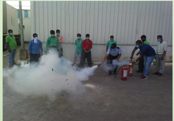
Fire drill carried out at TCW, Hyderabad