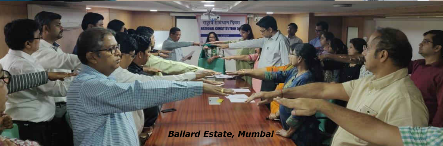
Ballard Estate, Mumbai