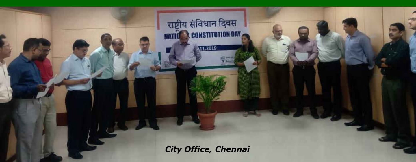
City Office, Chennai