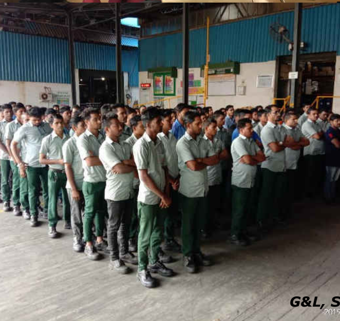
G&L, Silvassa 2019