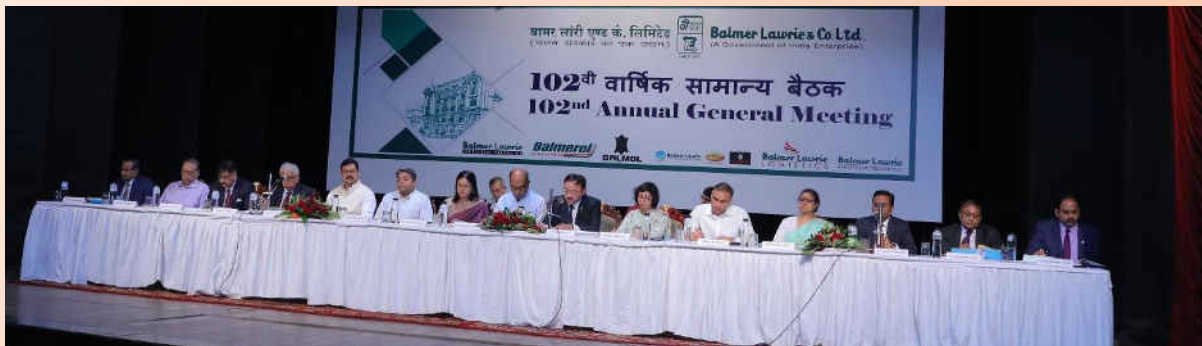
The 102nd Annual General Meeting at Kolkata; Seen in picture are the C&MD, Directors and Company Secretary

Every year in the month of September, Balmer Lawrie witnesses two significant events - The Annual General Meeting (AGM) of our Company and the Hindi fortnight celebrations. We also celebrate Vishwakarma Puja in our factories and offices in the Eastern Region in this month. The AGM this year was held at the Birla Sabhaghar in Kolkata on 18 th September. Hindi Divas was celebrated on 14 th September 2019. The Constituent Assembly of India adopted Hindi in the Devanagari script as the official language of India on 14 th September 1949. The Hindi fortnight programs are being organised around this day in all the four regions across the country. In the Eastern Region the Hindi Pakhwara celebrations commenced on 14 th September and would continue till 28 th September 2019. Globally, Hindi is the fourth most spoken language in the world and in India around 50% people speak Hindi. As per census figures there has been an increase of 10 crore people speaking in Hindi from 2001 to 2011, thus, making Hindi the fastest growing language in the country. The importance of the Hindi language has been recognized by MNCs as well. Today, the popular search engines, news sites and online shopping sites are available in Hindi. It is interesting to learn that in the year 2017, the Oxford Dictionary for the first time included words like Achha , Bachcha , Surya Namaskar and Bada Din . Request all of you to proactively work towards enhancing the use of Hindi in our official work and communication.