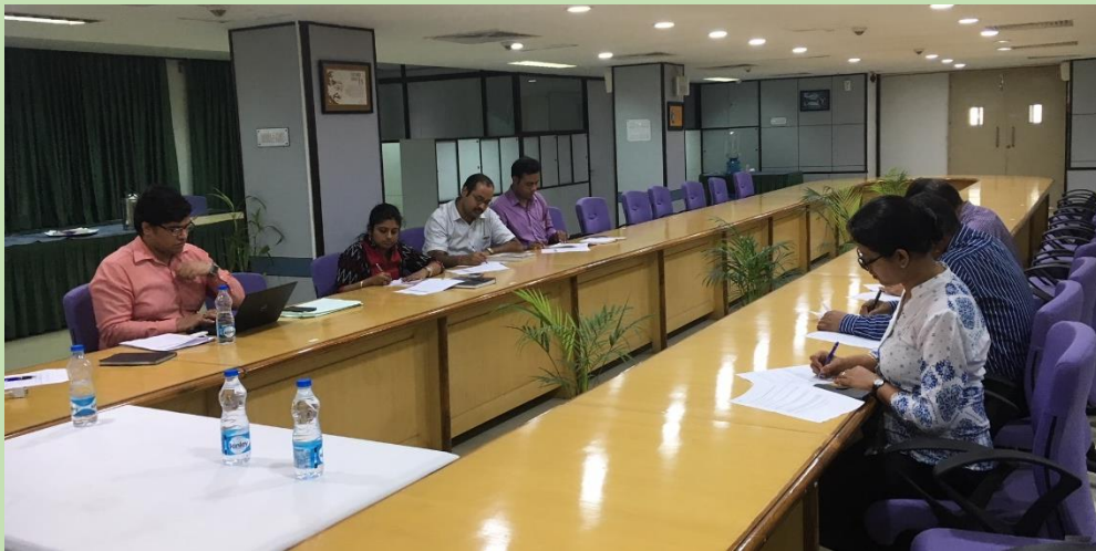
Employee engagement at the Corporate Office, Kolkata