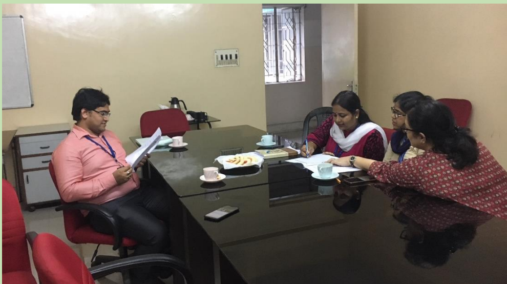
Meeting at the Indian Institute of Cerebral Palsy, Kolkata