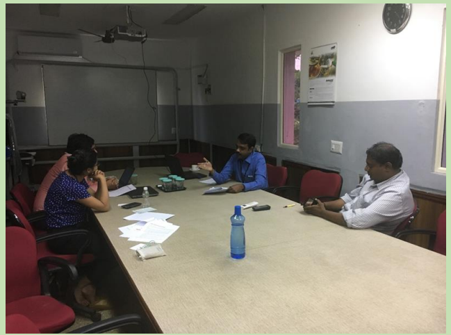
Meeting with vendors of SBU:LC