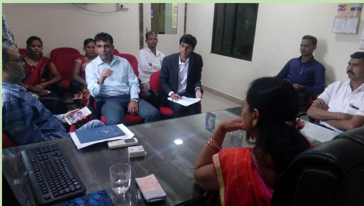
Stakeholder meeting at Silvassa

Below are glimpses of various stakeholder engagement: