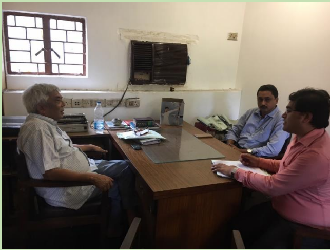
Meeting with a customer of SBU:G&L