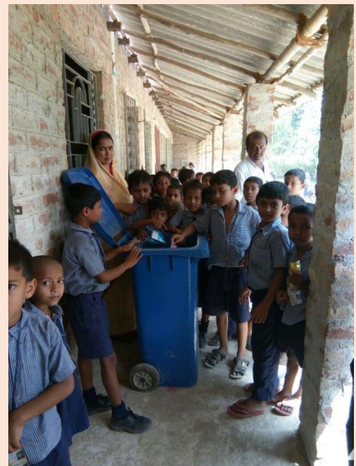
Use of Dustbin by Students

As part of the Swachh Bharat Abhiyan, toilets were constructed in schools in the Western Region. Toilet maintenance work was undertaken on need basis and dustbins were distributed in schools in West Bengal, which are being used by students.