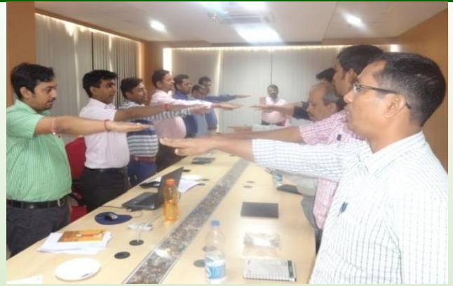
Safety Pledge at G&L, Silvassa

Below are the names of the winners of the online Safety Quiz organized during the National Safety Week. Congratulations to all the winners!