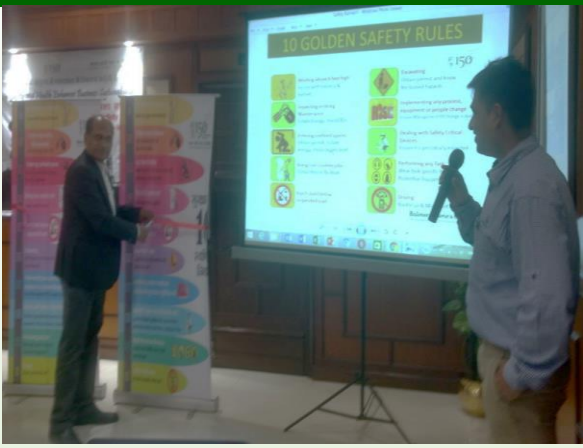
Inauguration of Golden Safety rules at the Corporate Office, Kolkata