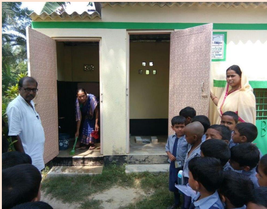
Toilet Maintenance in a School in West Bengal