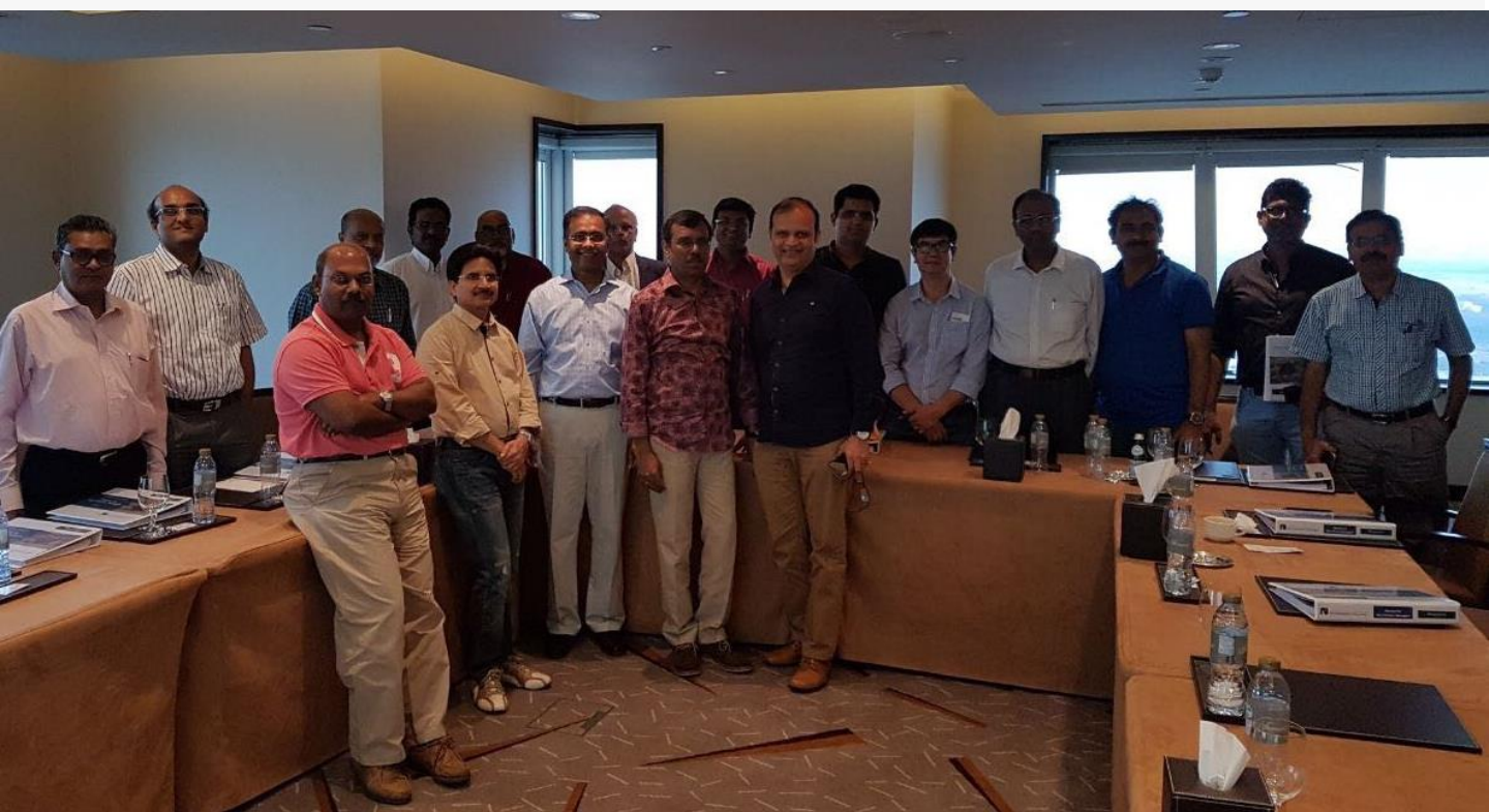
A workshop on "Finance for Non-Finance" was organised for Officers of BL UAE in two batches. The workshop for the first batch was held on 3 rd & 17 th February and for the second batch on 24 th February and 3 rd March.