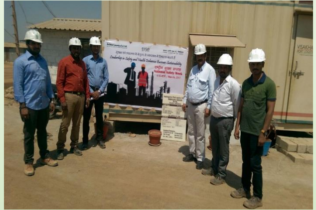
Safety Pledge at MMLH, Vizag