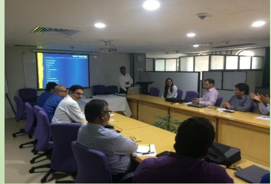
Defensive driving program at Corporate Office