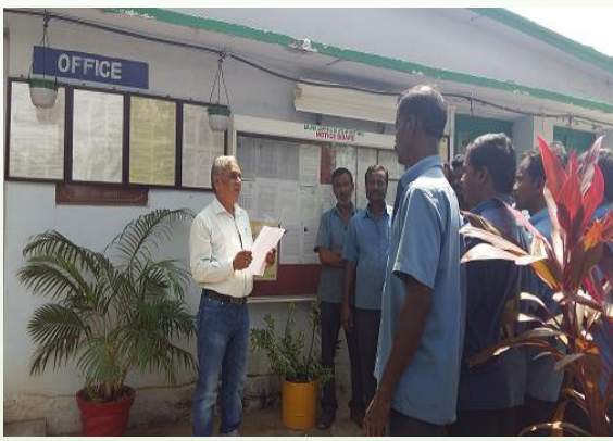
Safety Pledge at IP, Chittoor