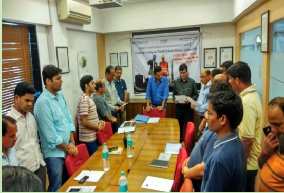
Safety Pledge at CFS, Mumbai