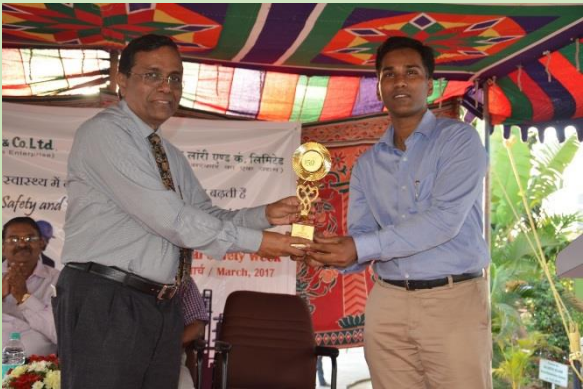
Director [Manufacturing Businesses] handed over prizes to the winners at Chennai