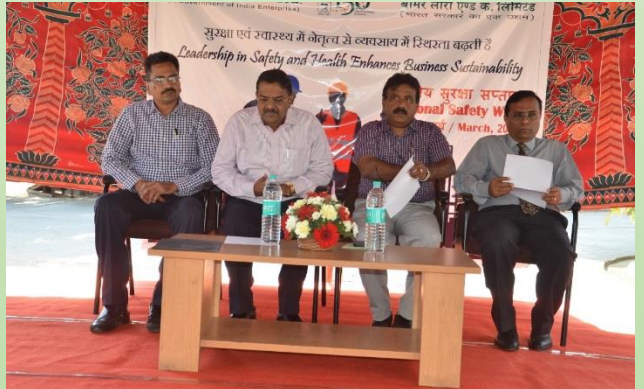
Director [Manufacturing Businesses] , Additional Director and Joint Director, Directorate of Industrial Safety & Health at the closing ceremony in Chennai