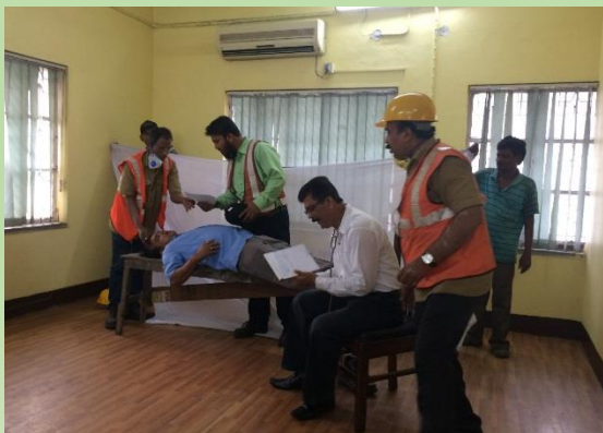
Safety Skit Competition at G&L, Kolkata