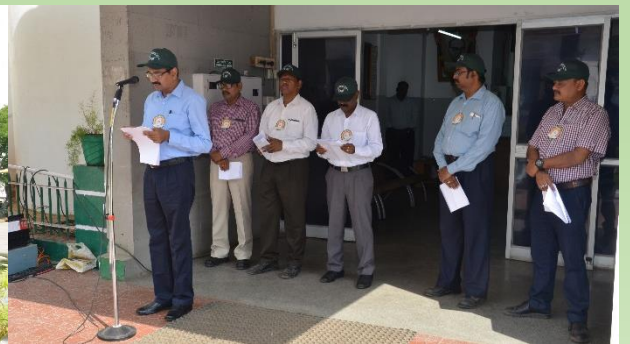
Safety Pledge at Manali, Chennai