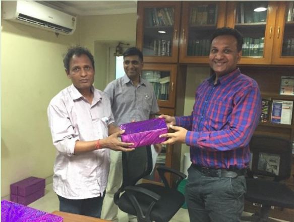
Pries being given away to Spot the Hazard contest winners at G&L, Kolkata