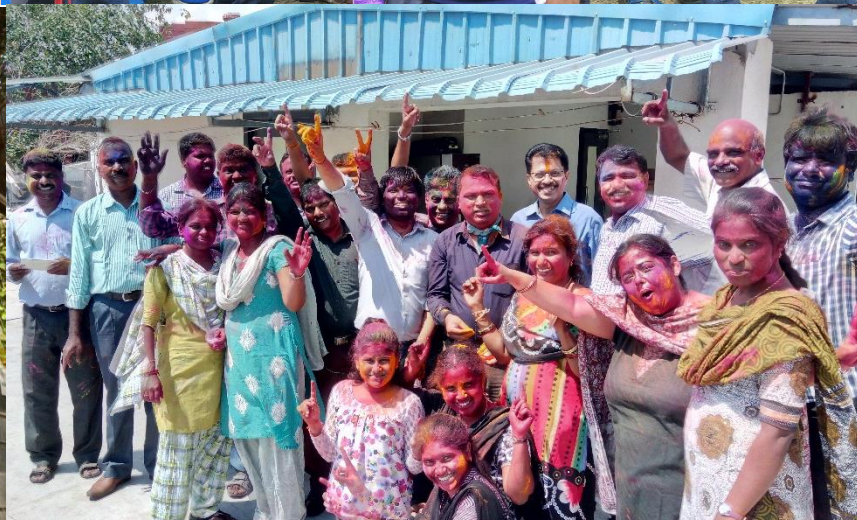
The festival of colours was celebrated with much fervor by the Vacations Exotica team at their Bangalore Office and by the Balmer Lawrie team at the City Office in Chennai. In photo is Team VE, Bangalore (L) and the Team at the Chennai City Office (R).