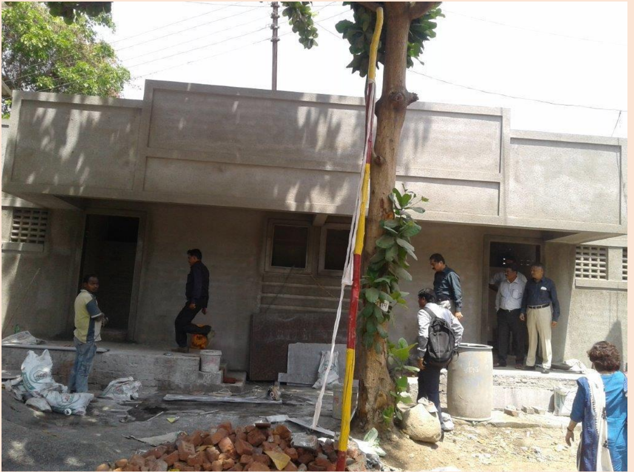
Toilet blocks for boys and girls were constructed at the Chatrapati Shivaji Vidyalaya, Palspe, Panvel.