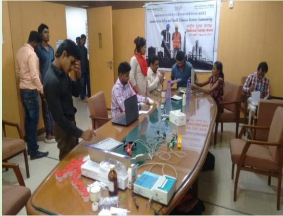
Health Check-up Camp at IP, Taloja (Navi Mumbai)