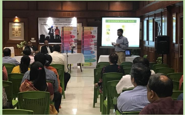
Safety Quiz Contest at Corporate Office, Kolkata