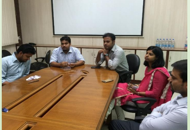
Extempore Competition at Corporate Office, Kolkata