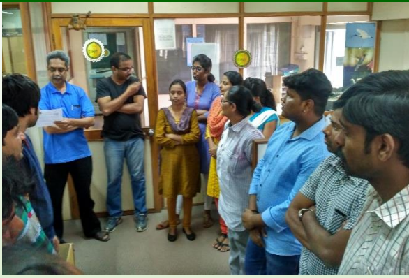
Safety Pledge at LS, Bangalore