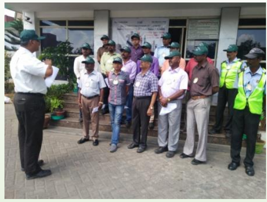
Safety Pledge at CFS, Chennai