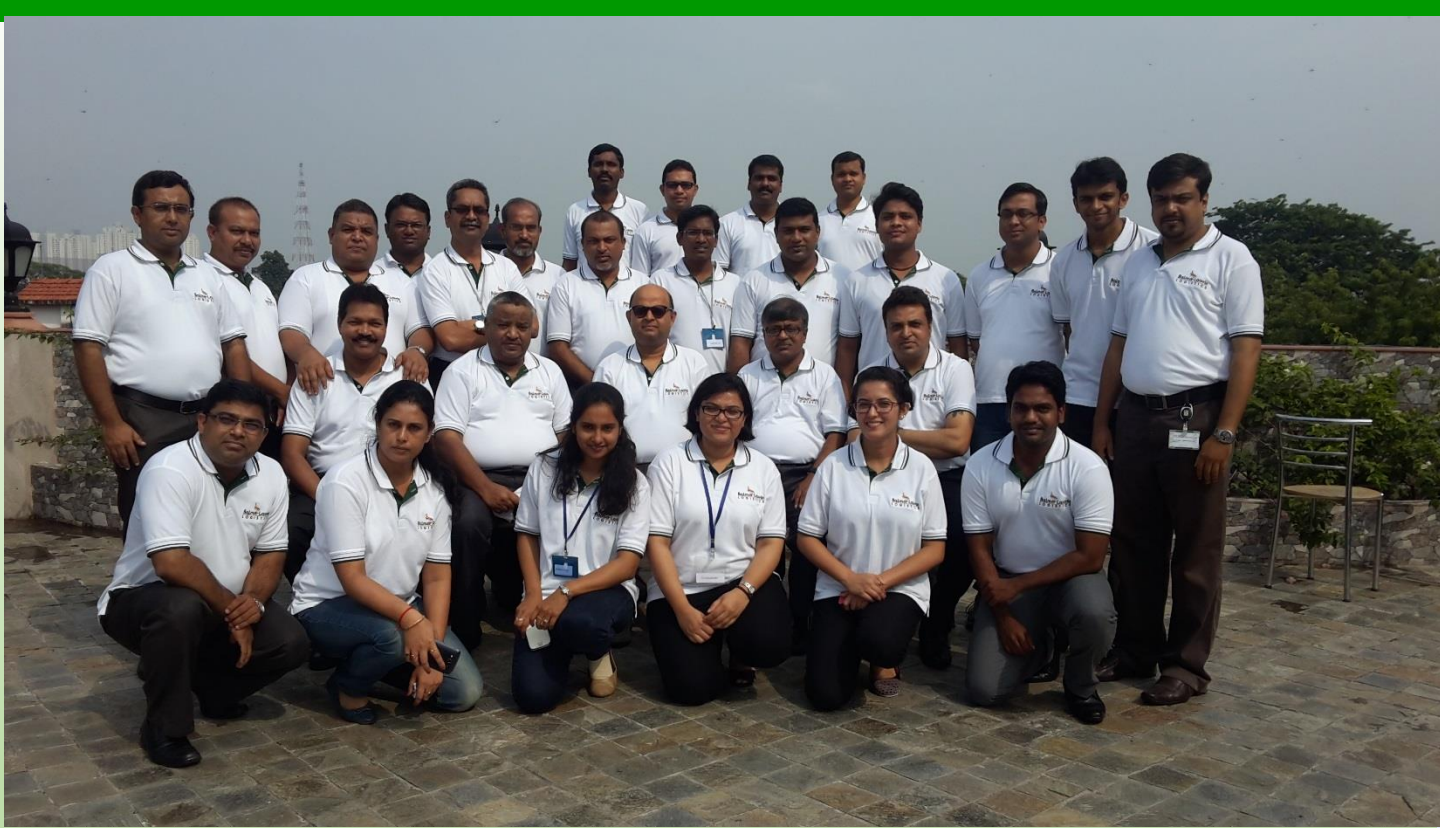
A Product Knowledge and Integration Program for SBU:Logistics was held at Tolly Club, Kolkata from 21 st to 23 rd September. The program was inaugurated by C&MD in the presence of Director [Service Business] and COO [Logistics].