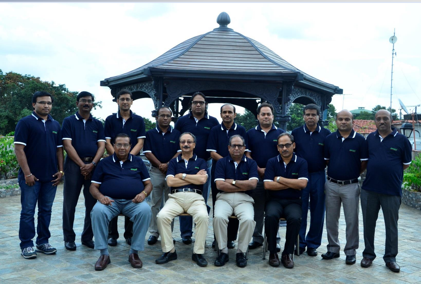
SBU:G&L organised a Supply Chain Management (SCM) Meet for employees at Tolly Club, Kolkata on 11 th and 12 th September 2015.