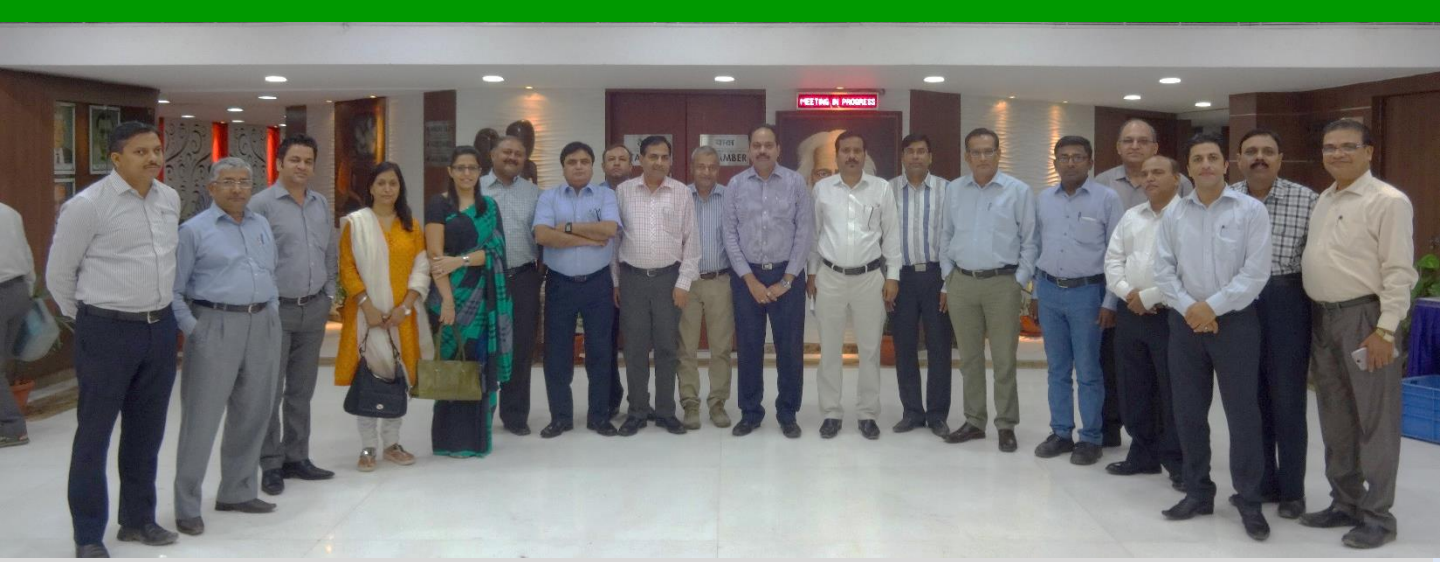
A one-day training program on discipline was organised for twenty executives of the northern region on 1 st October. SVP [HR] was the faculty of the program.