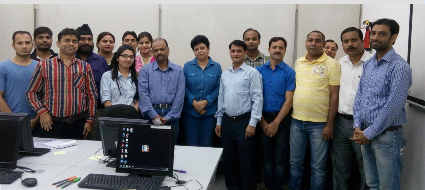
A training program on soft skills was organised for employees of Travel & Vacations at New Delhi on 26 th September. The program covered topics like The Art of Saying No, Communication Skills, Telephone Etiquettes, Listening Skills stc. Head [Travel Services] and CM [HR] – NR inaugurated the program.