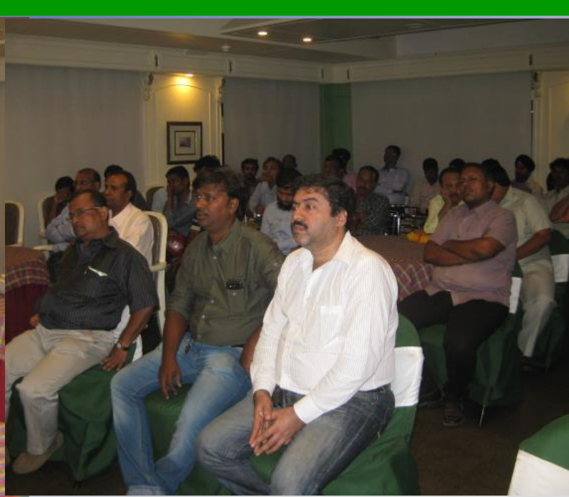
A new distributor commissioning program was held on 29 th September at Tolly Club, Kolkata for M/s Mangalam Enterprise, a new distributor of Balmerol Lubricants in South Kolkata.