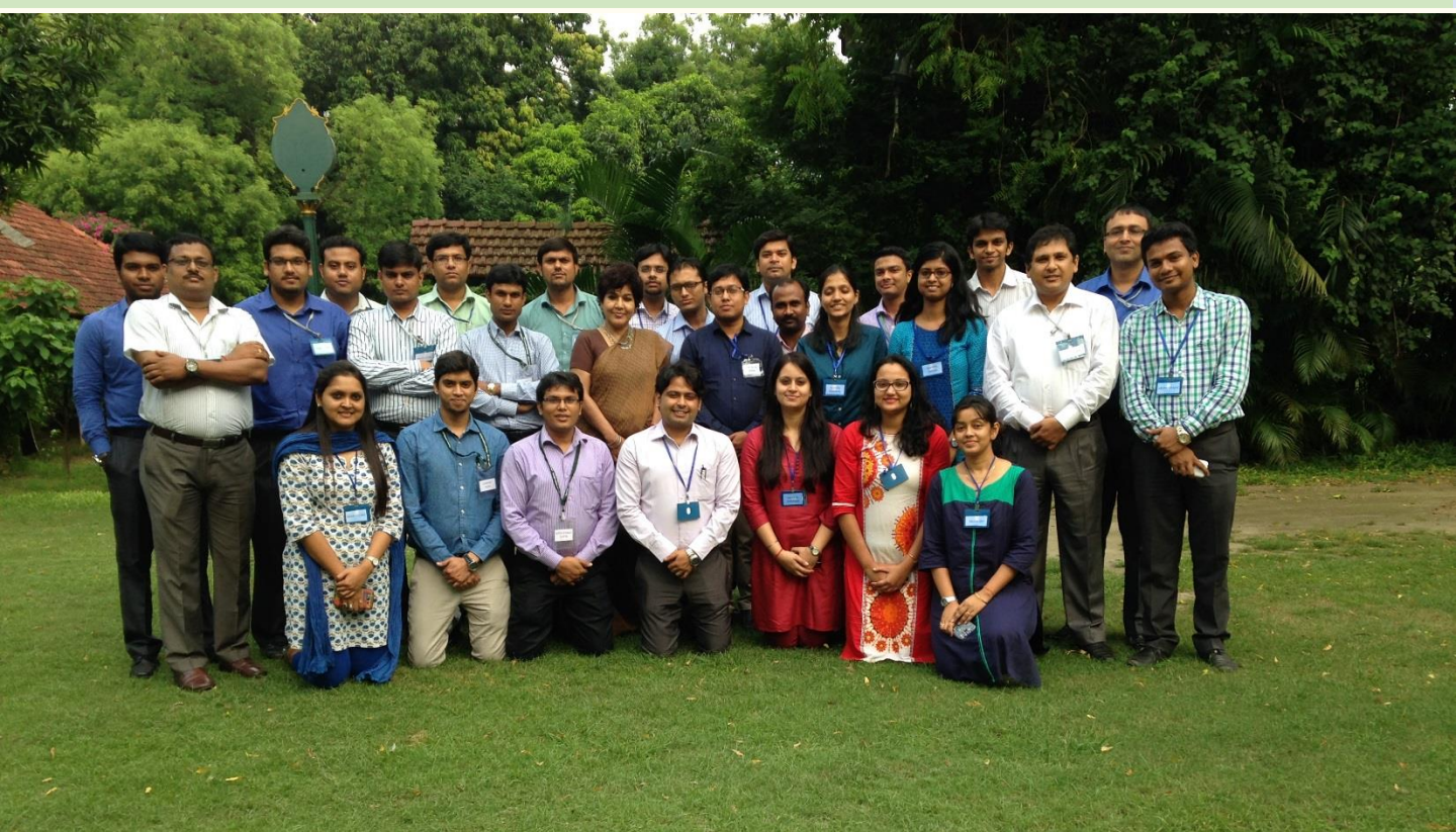
One-day training programs on Business Etiquettes are being organised across locations in several batches for employees. The first such training program was organised at Tolly Club, Kolkata on 8 th September. Director [HR&CA] was the faculty for the program. In photo are the participants along with the faculty.