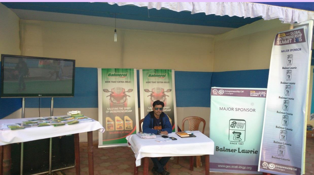
Balmer Lawrie was one of the major sponsors of the Global Entrepreneurship Summit 2015 held at IIT – Kharagpur from 16 th to 18 th January 2015.