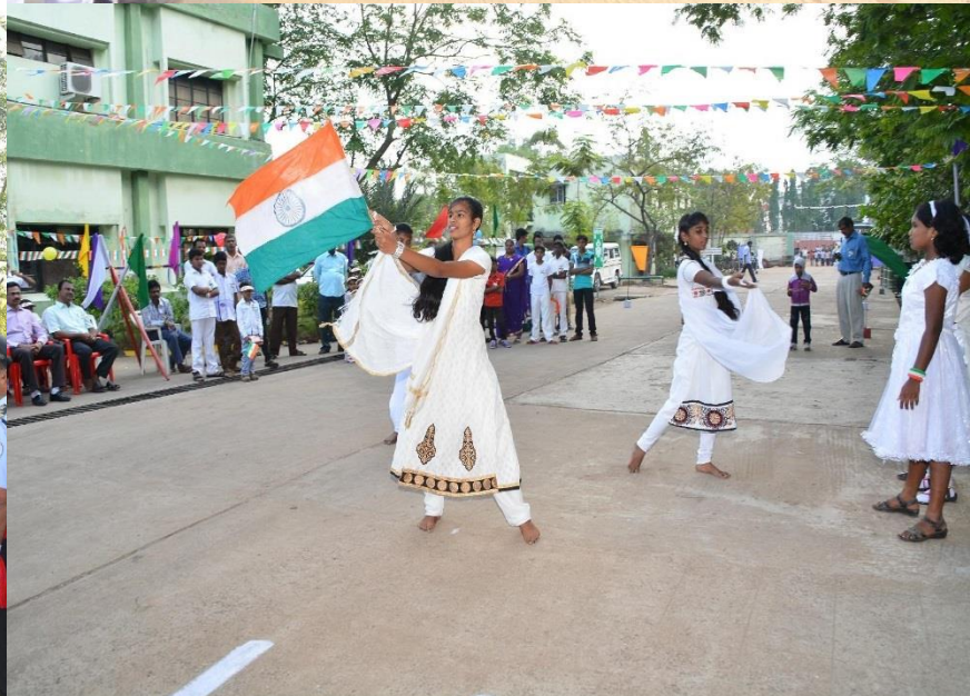
Republic Day was celebrated in various units on 26 th January. Besides the flag hoisting ceremony, there were dance performances by school students at Manali. In photo are glimpses from G&L and IP - Kolkata, Silvassa and Manali.