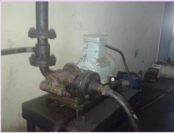
Flame proof motor installed for HSD transfer pump