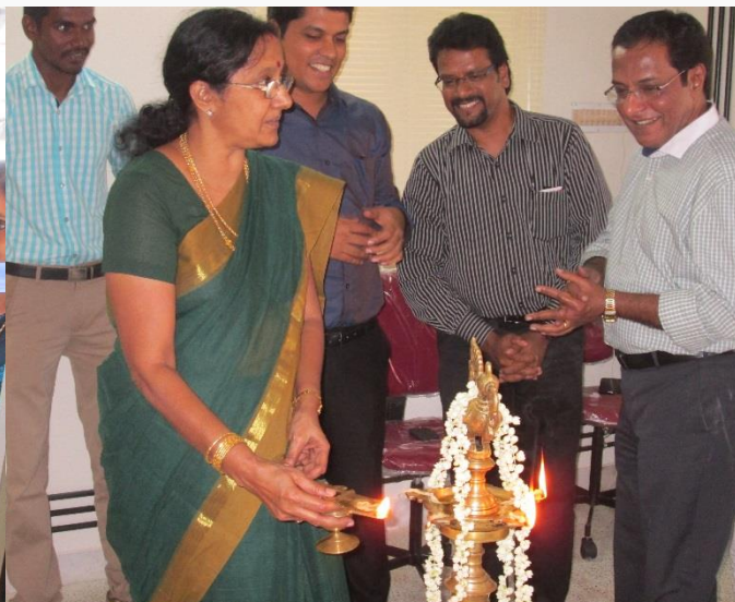
The LS and T&V teams at Cochin have shifted to a new office, the address of which is as follows: 40/8147 D , Ground Floor Narakathara Road Kochi - 682 035 Telephone no. (temporary): 0484 235 1025 The new office was inaugurated on 3 rd February 2015.