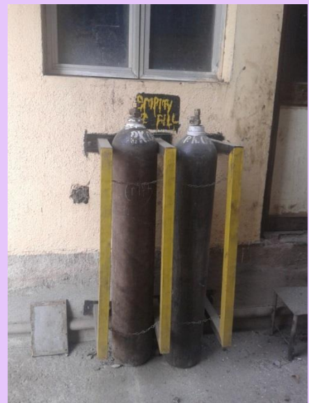
System to stack cylinder vertically with chain