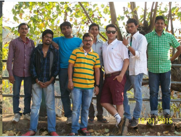
As part of recreational activities in Silvassa, a leisure trip to Dhabosa waterfall was organized on 18 th January 2015.