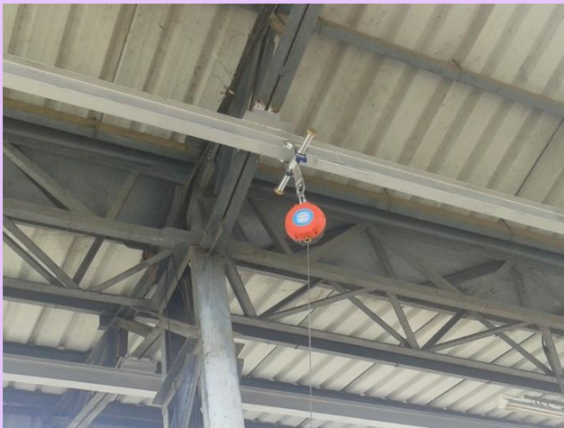
Fall arrest system installed for people working on tanker top