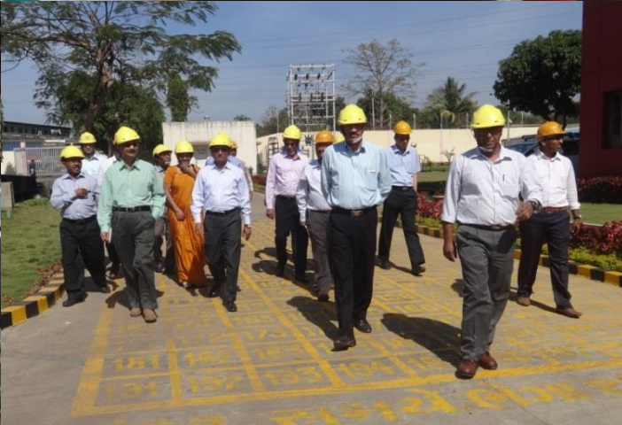
C&MD and Directors visited the G&L and IP plants at Silvassa on 13 th January 2015.