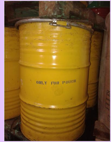
Used & reusable barrels are properly labeled & segregated for easy identifications