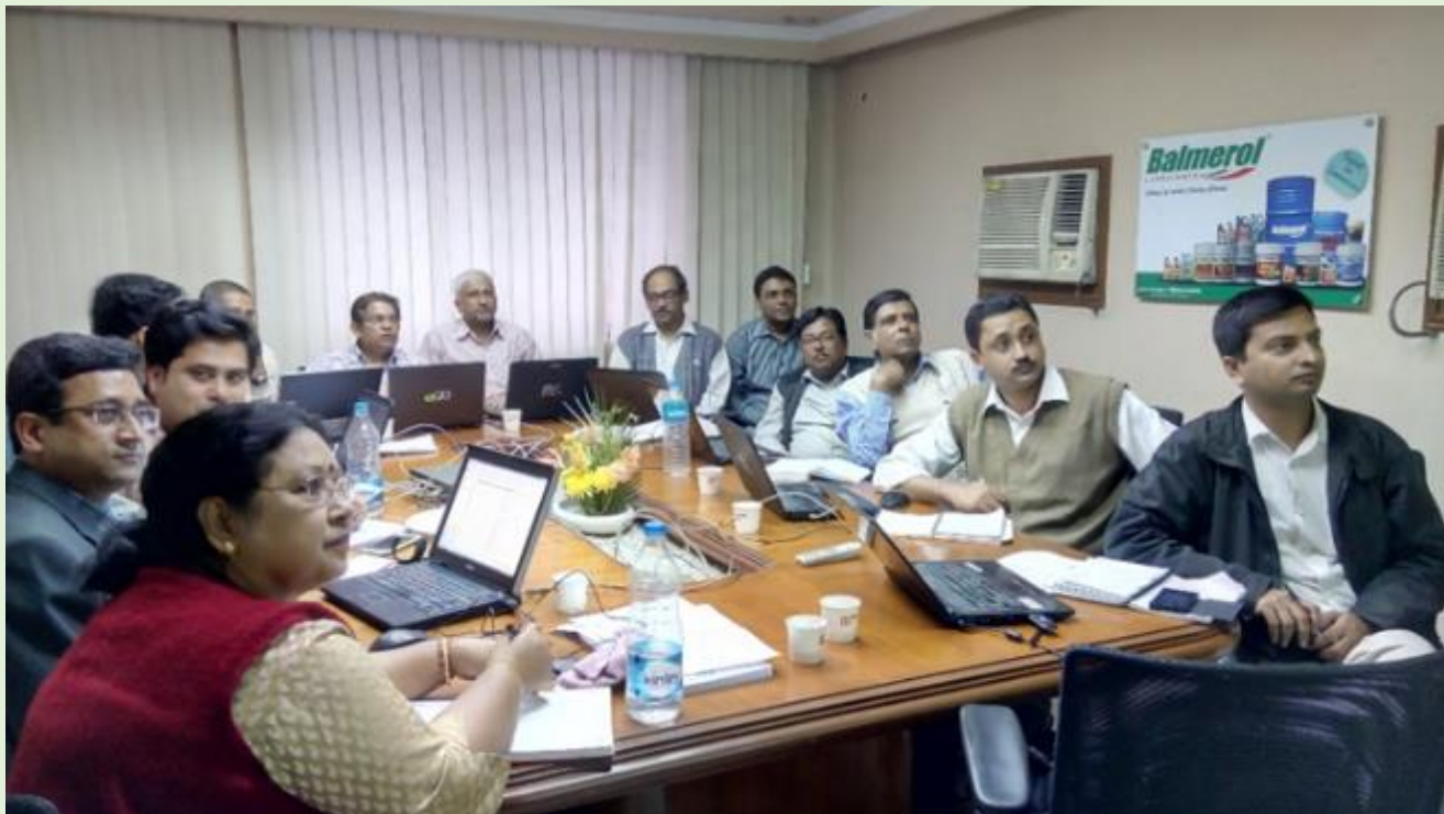
SD users training session in progress at G&L Kolkata

At the onset, sessions for function based training for MM, SD, PP and QM have been planned for separate batches at the HO, G&L - Kolkata, Chennai & Silvassa spanning from 1 st to 3 rd week of February 2015.