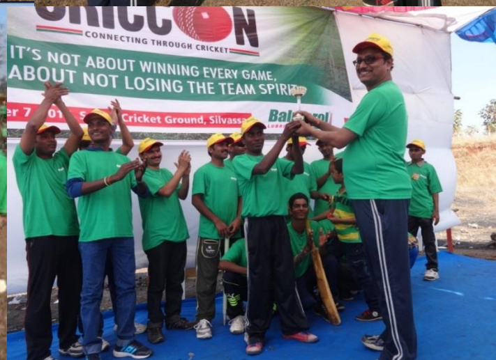
CRICCON [Connecting through Cricket], a Cricket Tournament was organized by G&L Silvassa to foster team spirit and better connect, as a part of its employee welfare initiatives. BL employees, workers and their family members participated in the tournament which was held on Sunday, 7 th December 2014.