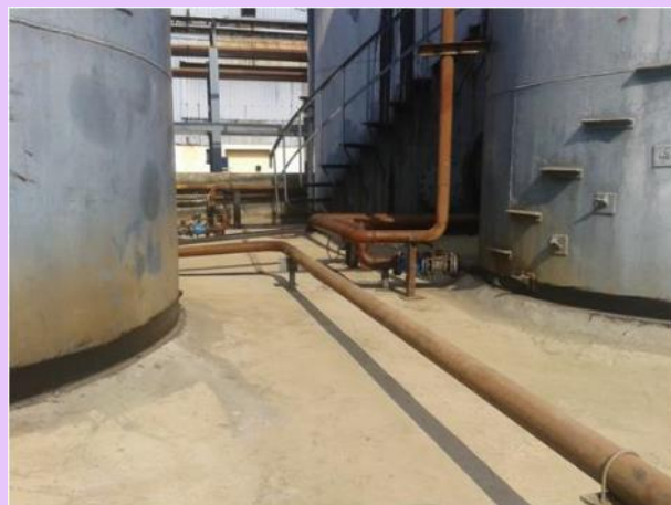
Double body earthing of all tanks