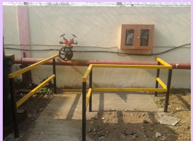
Barricading done in front of fire hose box for free access during emergency