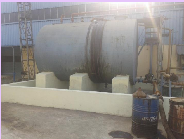
Secondary containment made for base oil storage tank