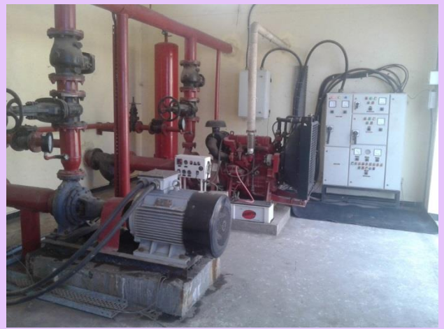
Completion of fire hydrant system, including main & jokey pump