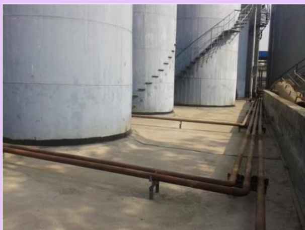
Concretizing of tank farm yard